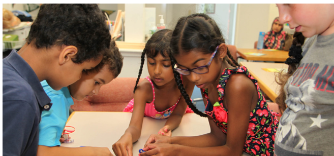
15-LOVE Participants learn about circuits during their STEM programming.