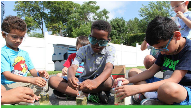
15-LOVE kids participate in a STEM demonstration.