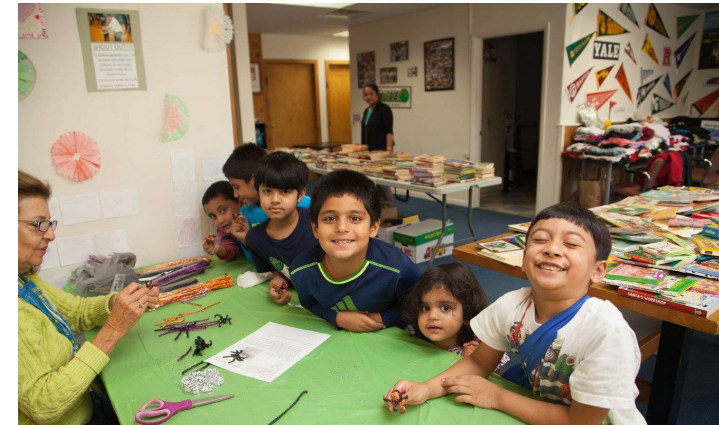
Book giveaway attendees participate in a hands-on arts and crafts activity.