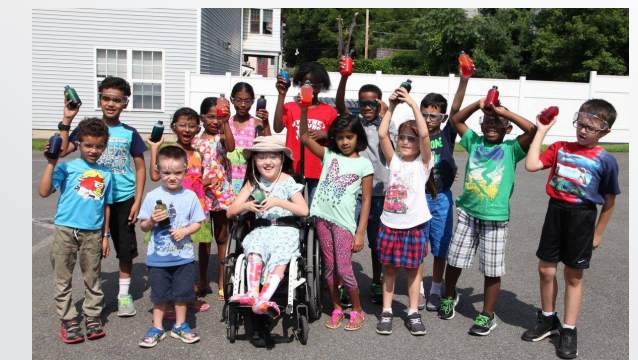
STEM participants show off their lava lamps.

15-LOVE is always striving to adapt to the wants and needs of the community, which is why we are so excited to announce our new partnership with SUNY Polytechnic Institute. The need for workers in the technical, science, and mathematics force is growing, and we want to be sure that the inner-city population is not left out of the opportunity to be a part of the next tech boom. With the help of our volunteers from SUNY Poly, we believe that we can help foster passion and curiosity for STEM fields within our participants.