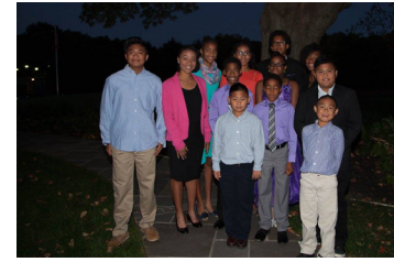
15-LOVE participants pose for a group photo at the FLM reception.

Fore Love & Money attendees were treated to a lovely fall day this past October due to it being rescheduled in June. The sun was shining and temperature just about 70 degrees for our 25th Annual event - a perfect day for some golf and tennis.