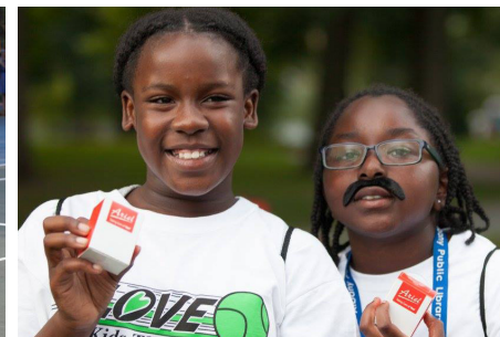
Jamboree attendees show off their new pedometers from MVP Health Care.