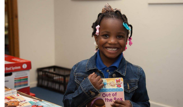
A book giveaway attendee was all smiles after receiving her two new books.

15-LOVE held it's Fall book giveaway in October for underserved youth across the Capital Region. Over two hundred people attended the book giveaway, children received two new books and an unlimited number of gently used books in a reusable bag. Attendees made a spider ring and had a clementine for a healthy snack. We are always in need of additional picture and early chapter books. Donations of books are tax deductible. Please call our office at (518) 438-2039 if you have gently used or new books you would like donate.